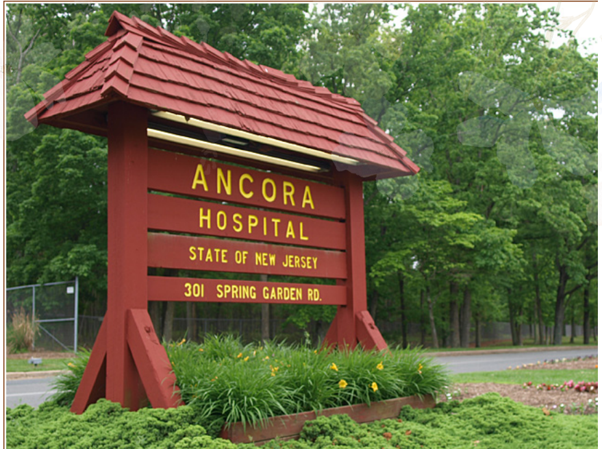
CAMDEN, N.J. -- Ancora Psychiatric Hospital was opened in 1955 and sprawls across more than 600 heavily wooded acres at the edge of the Pinelands.

Declarations, Inc. is excited to invite any programmatic staff members to participate in the upcoming Community Provider & Employment Fair at Ancora Psychiatric Hospital. This event will take place on Wednesday 4/22/26 and will feature both a morning presentation session and an afternoon open fair style event designed to connect providers with staff and Ancora Psychiatric Hospital patients. Please note, Declarations, Inc. will be participating in the afternoon session only , which will be held from 12:30 - 2:30pm.